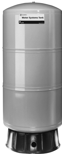
Stand Model (Vertical)