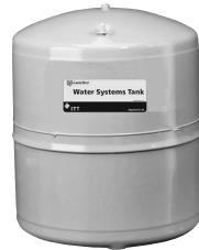
In-Line Pipe Mounted Model